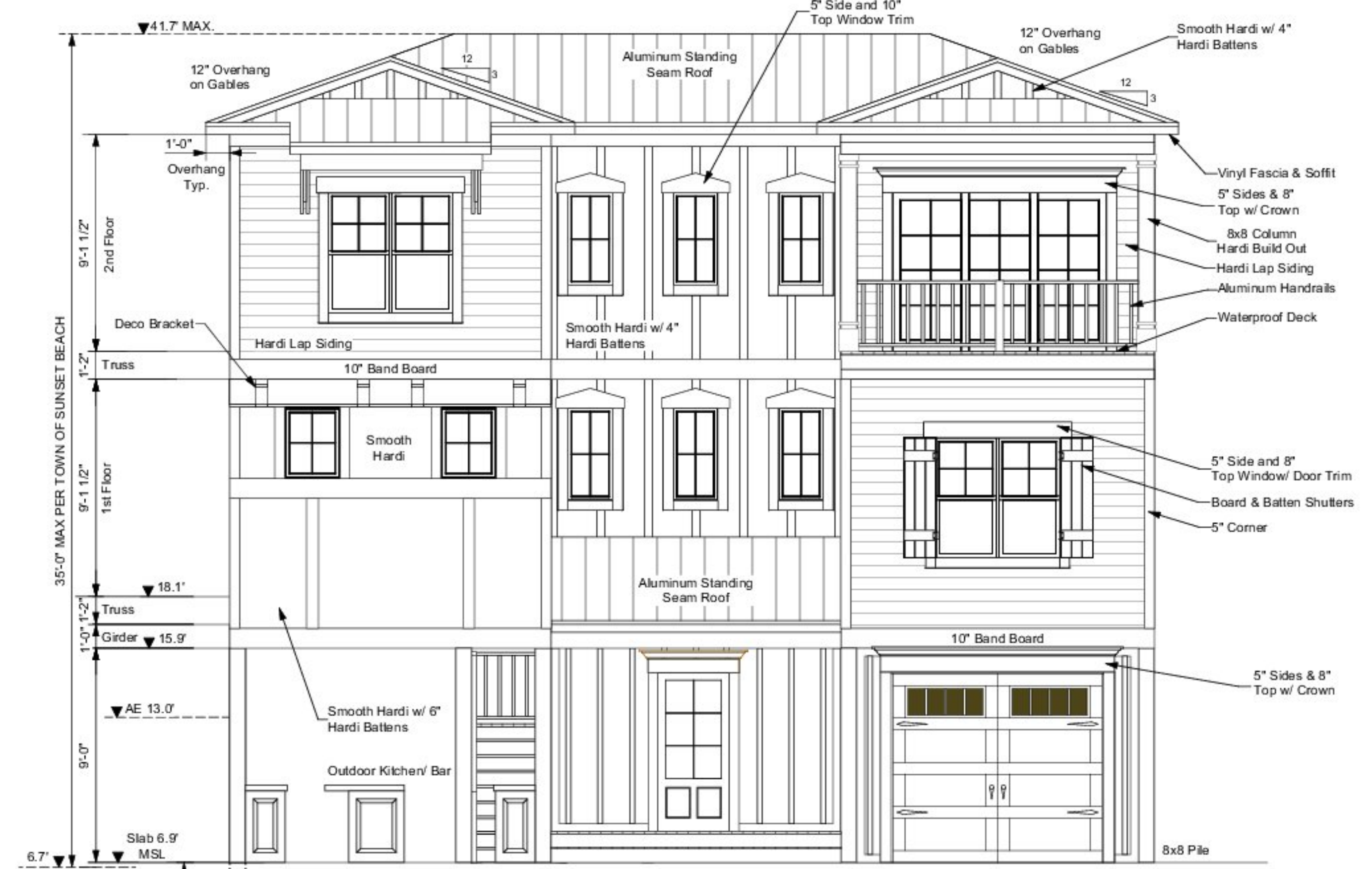
FRONT ELEVATION - RIVERSIDE DRIVE