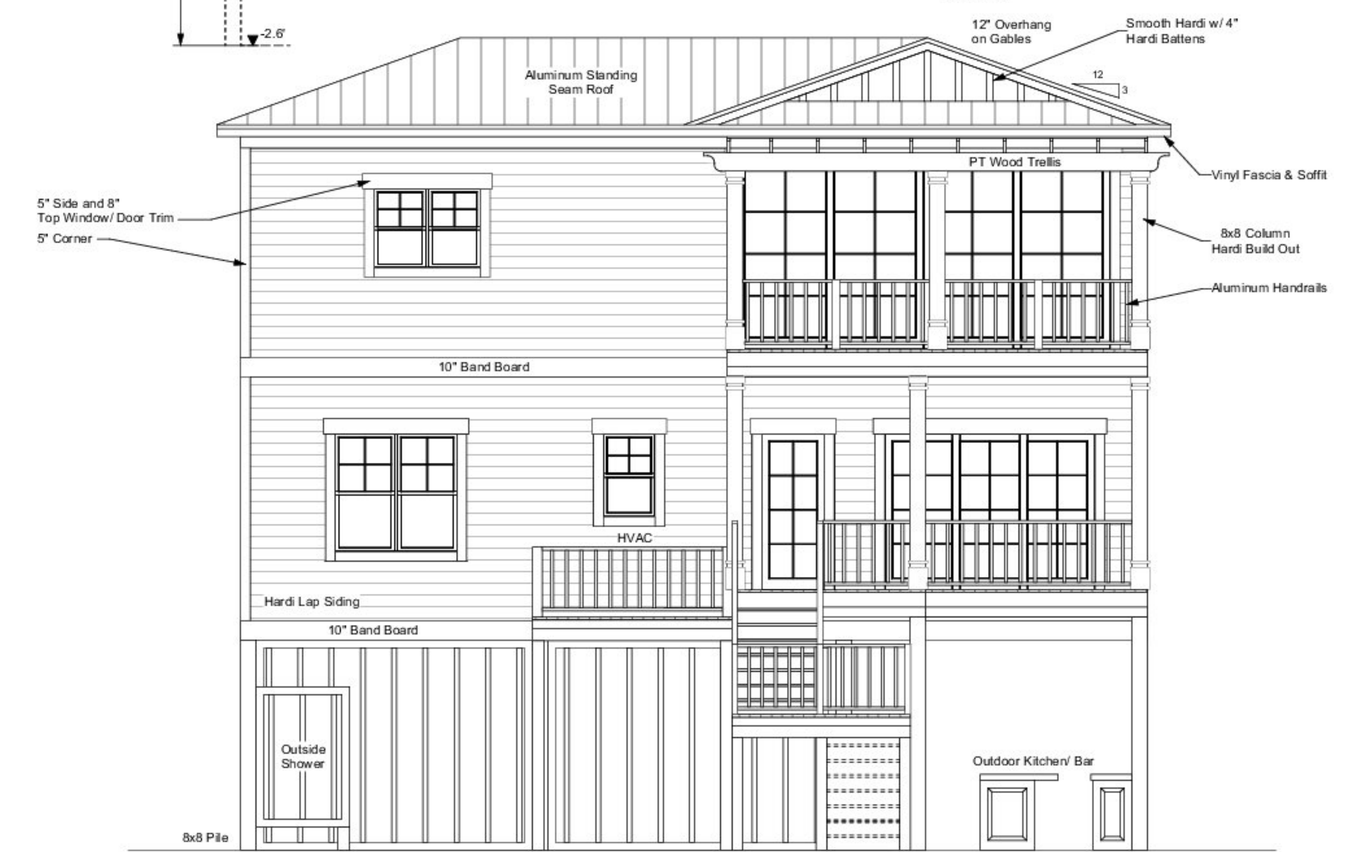
REAR ELEVATION - JINKS CREEK FEEDER CANAL